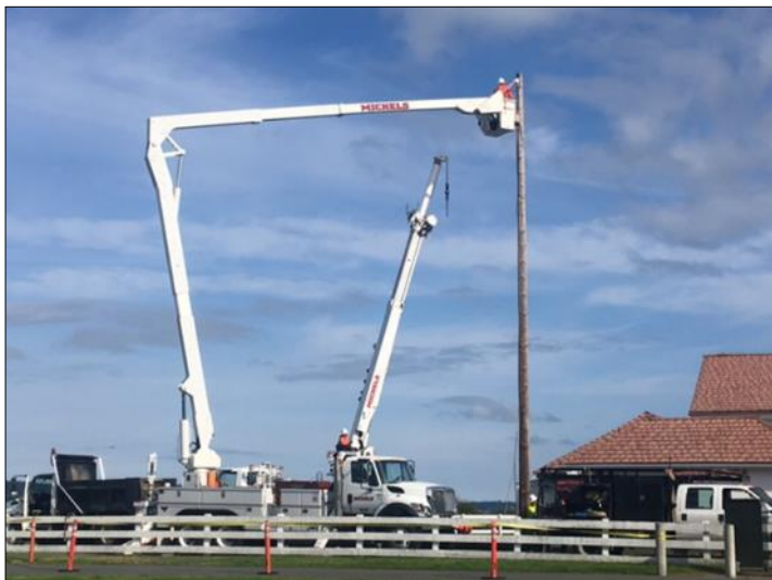
USCG Vendors Replacing the Antenna and Wooden Pole.

We know the MLS is home to two active United States Coast Guard (USCG) Aids to Navigation. The first, a light encased in a Fresnel Lens which was made by opticians in Paris, France in 1852. Visible for 10-12 miles on a clear night, the signature flash is every 5 seconds (2