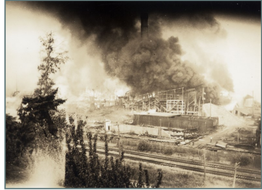
Crown Lumber buildings burned on August 30, 1938. This site is now becoming the new Washington State Ferry Terminal.