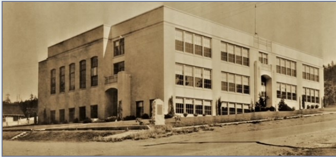
Rosehill School opened in September, 1928

Rose Hill School saw several generations of students graduate over the next few decades, until the fateful night of March 17th, 1928 -- St. Patrick's Day. The quiet evening which marked the end of the holiday was punctuated by an uproar. A young boy discovered flames and sounded the bell which alerted firefighters. The crew, composed only of volunteers, had to pull a hose by hand out of a garage across the