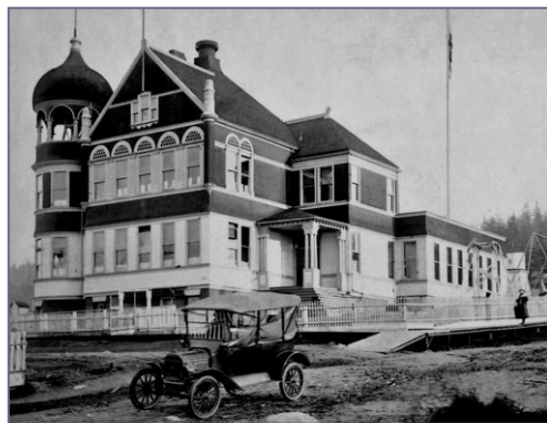
The Old Rose Hill School built in 1893.

simple exterior. It is easy to imagine that in such a small town, the construction of Rose Hill school would cause a stir among residents. Designed by Fredrick A. Sexton, Rose Hill became a striking feature of the landscape. It was significantly taller than the surrounding buildings, with decorative arches and details along the front and entrance. Perhaps the most striking feature, however, was the tower just off the building's right which housed the school bell. At the top it was crowned by a pointed dome which completed the stately